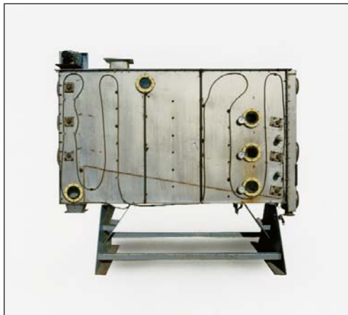
Down Draft Desolventizer (DDD)