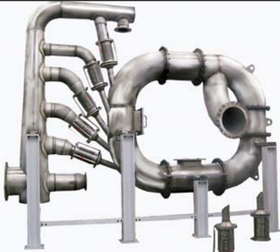
Milling Flash Dryer