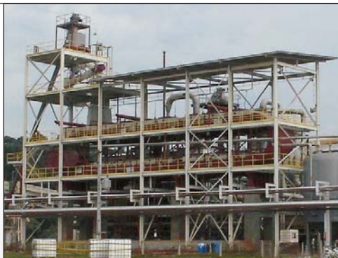
Model III Percolation Extractor, SPC