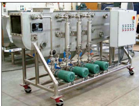
Model V Solid/Liquid Extractor