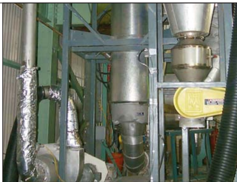
Vertical Flash Dryer or Low temp Calciner

Milling Flash Dryer: For applications where a fine end product is desired Type: Direct Contact, Pneumatic conveying Milling Action: Jet Milling using low pressure jets of air to setup inter particle collisions w/o moving parts. Gases include Air, Nitrogen, Superheated Steam, or Solvents. Residence times: less than one second Temperatures: 55° to 760° C Feed materials: Centrifuge and filter cakes, wet powders, and backmixed slurries Liquids: Water and other solvents