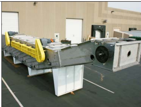
Model IV Immersion Extractor