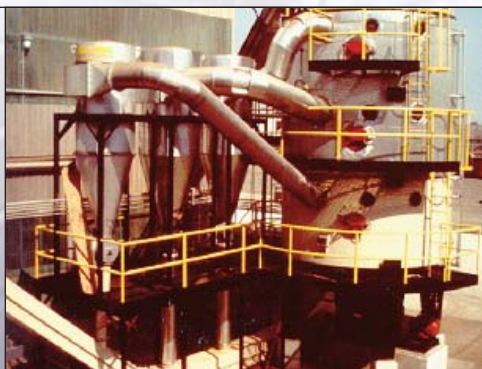
DTDC Desolventizer Dryer Cooler

DTDC Desolventizer Dryer/Cooler: Vertically oriented tray/semi-fluid bed dryer for granular materials or flakes Type: Combination Direct & Indirect Contact. Gases are Air, N2, Superheated steam Product Conveyance: Mechanical sweeps and semi fluidizing gases Residence times: 15 to 200 minutes Temperatures: up to 250° C in Indirect Contact Zones, 150° C in Direct Contact Zones Liquids: Water or other solvents. Vapor tight design.