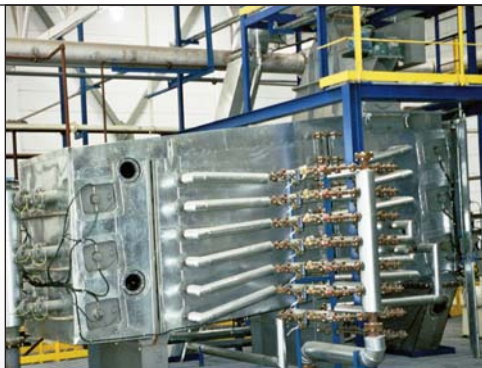
Down Draft Desolventizer

Vertical Flash Dryer: For applications where extended residence time is required for Drying or Low Temperature Calcination as with coarser products Type: Direct Contact, Pneumatic Conveying. Gases include Air, Nitrogen, Superheated Steam, or Solvents. Milling Action: None or Low Energy Dispersing Residence times: up to five seconds in the Dryer, not including the balance of the system Temperatures: 55° to 980° C Feed materials: Centrifuge and filter cakes, wet powders, and backmixed slurries Liquids: Water and other solvents